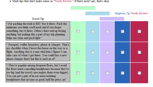
Figure 4. Early prototype interface: item clustering

In theory, Cascade can handle item-sets of arbitrary size, but the algorithm's expense grows super-linearly in the number of items. To date we've tested on five datasets, ranging in size from 22 to 200 items. In the future, we plan to use co-occurrence statistics to optimize the cost on large inputs.