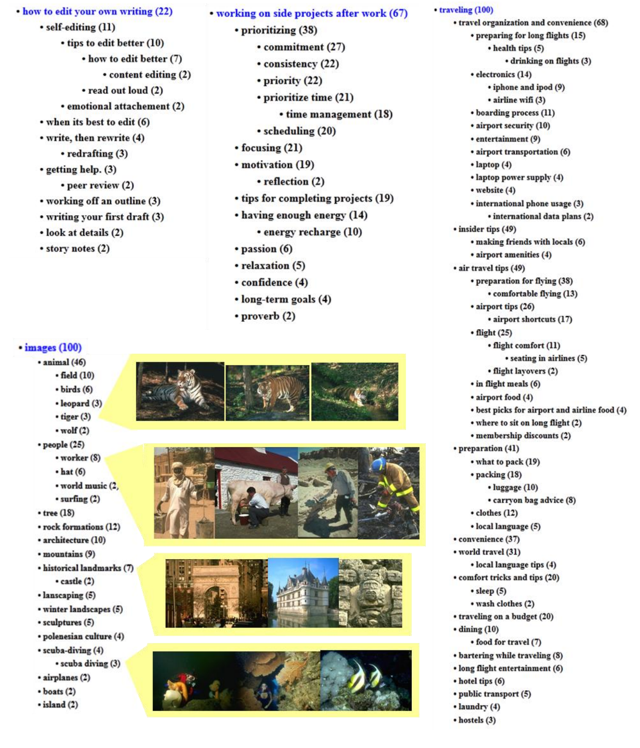
Figure 6 Taxonomies created by Cascade

[2], and Categorize is explored in Polarity [13] and is a common task on MTurk – it was the original reason Amazon created MTurk. Because Cascade uses common HIT types, workers do not have to spend the overhead of reading special instructions or learning a complex task.