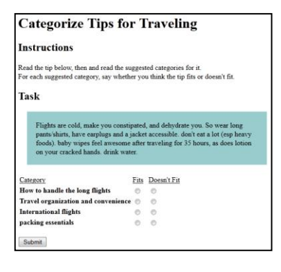
Figure 5. HIT Primitives: Generate, SelectBest, Categorize