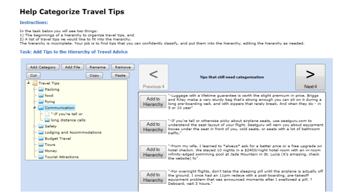
Figure 2. Early prototype interface: iterative improvement

adding, deleting, or moving categories or by placing items in the taxonomy (Figure 2). We observed that the iterative improvement interface suffered from two main problems: